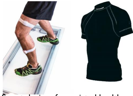
Smart devices for assisted healthcare and flexible probes (NanoDesign )